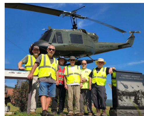
Post 190 adopted a 2-mile stretch of highway as part of Tennessee's Adopt-A-Highway Program. Their stretch of highway passes both the Legion post and VFW Post 7552.