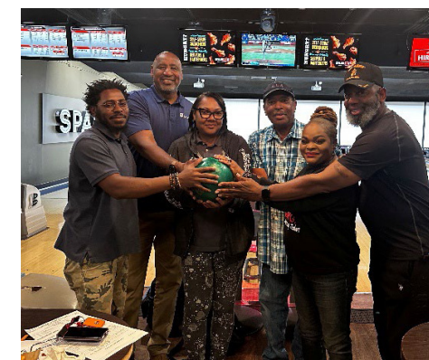
Post 291 hosted a Veteran Engagement Night with the Scenic City Heroes Bowling Team, who are currently ranked among the top three teams in their league.

To maintain your post's exempt status, avoid using language on your marquee that says "open to the public" or "everyone welcome." Exceptions are post open houses or community events like legislative debates.